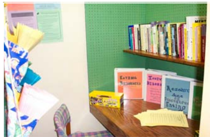
Eating Disorder Collection

The gallery features several exhibitions each year. It is on the lower level of Plough Library.